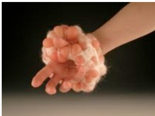
Eruption Cuff by Masako Onodera

MASAKO ONODERA IS HAVING AN EXHIBITION "TACTILE BODIES" AT THE WILLIAM BUSTA GALLERY IN CLEVELAND, OHIO, OCT. 14 - NOV. 12. THE OPENING RECEPTION IS OCTOBER 14, 5-9PM.